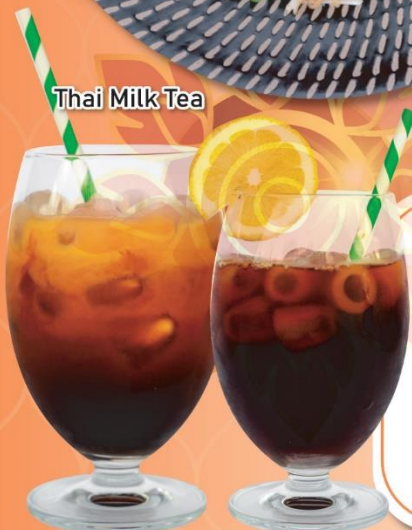
Thai Iced Lemon Tea