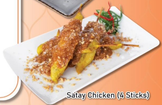
Satay Chicken (4 Sticks)